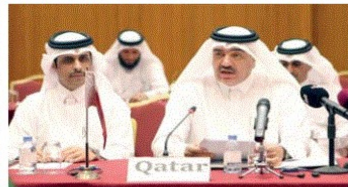
Minister of Municipality and Environment H E Mohamed bin Abdullah Al Rumaihi speaking at a meeting of Global Drylands Alliance in Doha yesterday.

On October 15, 2017, Doha hosted the GDA's founding conference where the convention of the new international organisation based in Doha was signed.