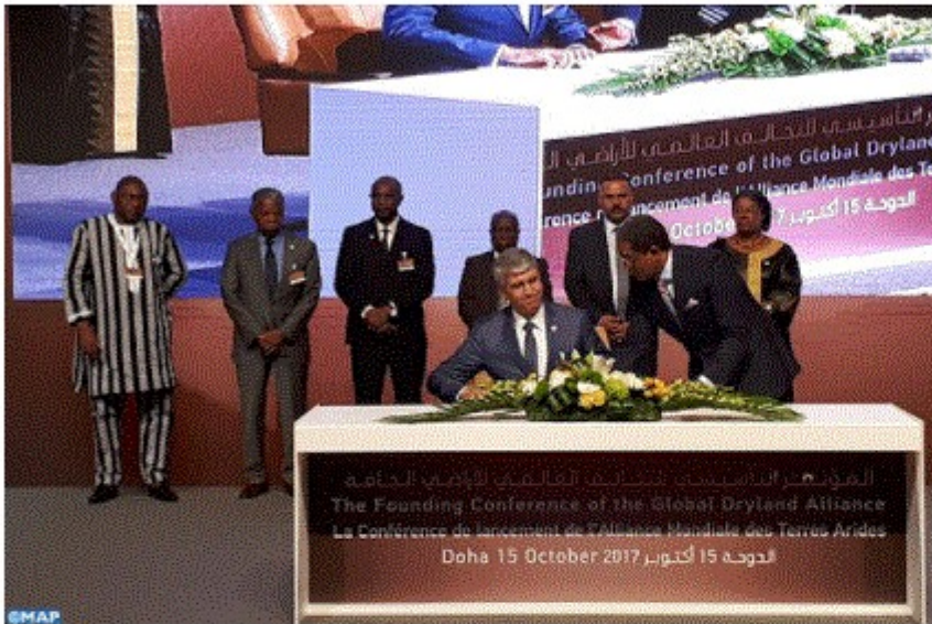
المؤتمر التأسيسي للحائفة العالمية للأراضي الجافة The Founding Conference of the Global Dryland Alliance La Conférence de lancement de l'Alliance Mondiale des Terres Arides Doha 15 October 2017 / الدوحة 15 أكتوبر 2017